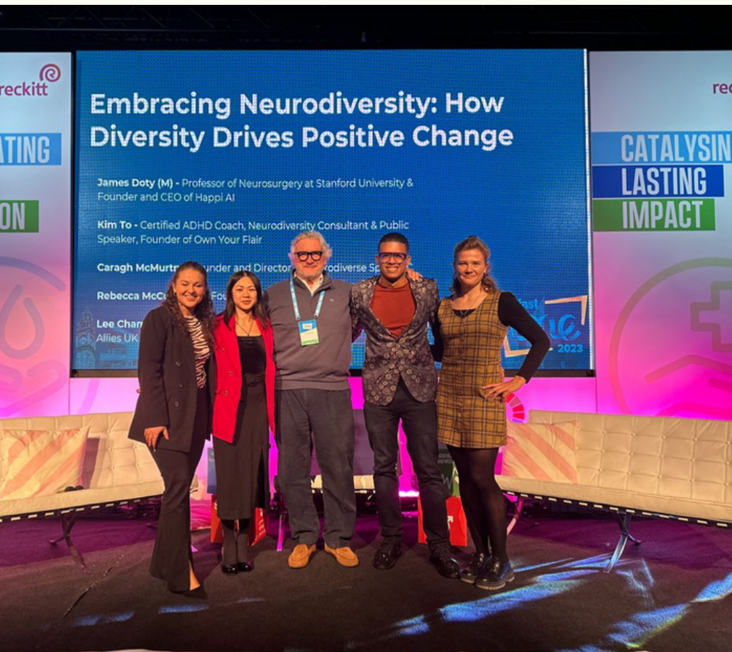
One Young World 2023 conference in Belfast